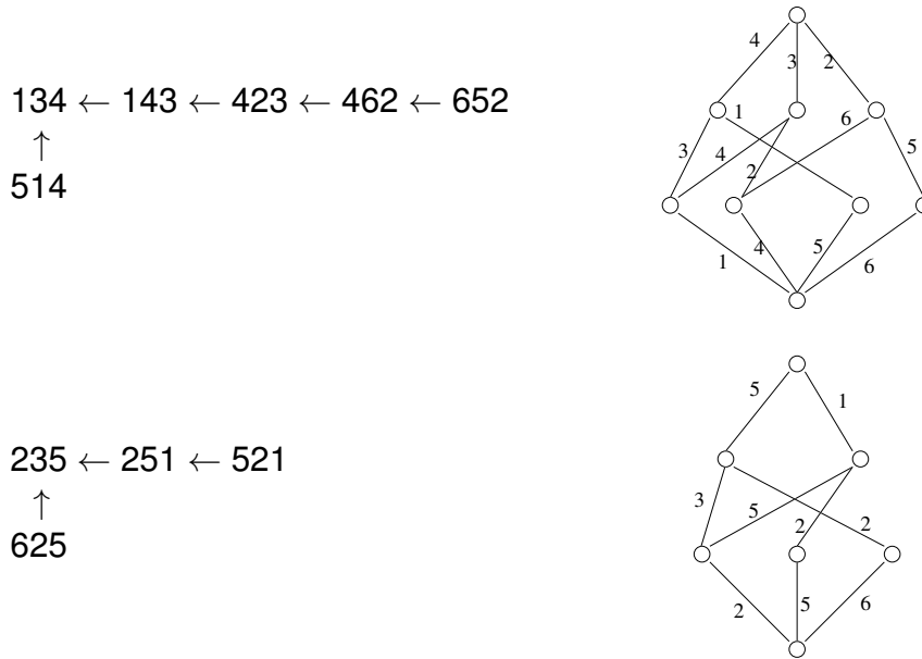
Fig. 3: On the left, we find the output of FLIP: two connected components. On the right the corresponding posets are depicted.

Example 1 Consider the 10 elements of B_3(1234, 4312) . Then the output of FLIP is depicted below. In the first column we have the two components of G , and in the right column the posets P_i corresponding to each component.