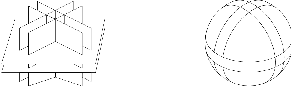
Fig. 2: The non-central arrangement x, y, z = 0, 1 and its associated spherical subdivision.

Let \mathcal{H} be a non-central hyperplane arrangement in \mathbb{R}^n with intersection lattice \mathcal{L} . Let \mathcal{L}_{ub} denote the unbounded intersection lattice , that is, the subposet of the intersection lattice consisting of all affine subspaces with the points (dimension zero affine subspaces) omitted. Similarly, let T_{ub} denote all of the faces in the hyperplane arrangement \mathcal{H} which are unbounded. We observe that T_{ub} is the face poset of an (n - 1) -dimensional sphere. Pick R large enough so that all of the bounded faces are strictly inside a ball of radius R . Intersect the arrangement \mathcal{H} with a sphere of radius R . The resulting CW -complex has face poset T_{ub} . Our goal is to compute the cd -index of T_{ub} in terms of the ab -index of \mathcal{L}_{ub} .